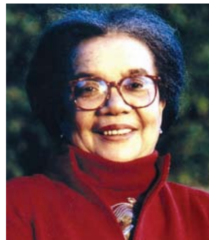
Marian Wright Edelman